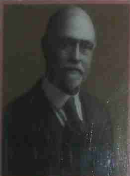
Prof. Irving Fisher